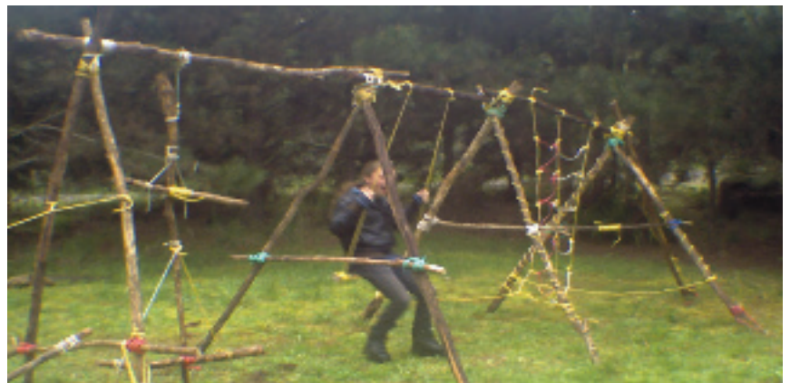
A 'child' tries out the children's playground

It was an excellent weekend but it was a shame more units did not participate as Whangarei Combined hosted an awesome event. Well done.