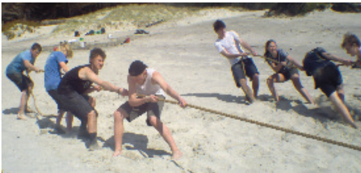
The big heave

The comradeship in Scouting was very evident than in the final run as the teams in third and fourth decided to pair up and cross the line together so as not to affect their points standing in this final event.